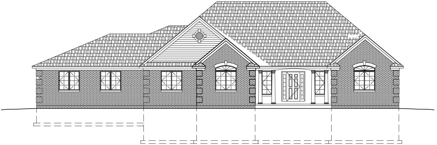
FRONT ELEVATION A-1